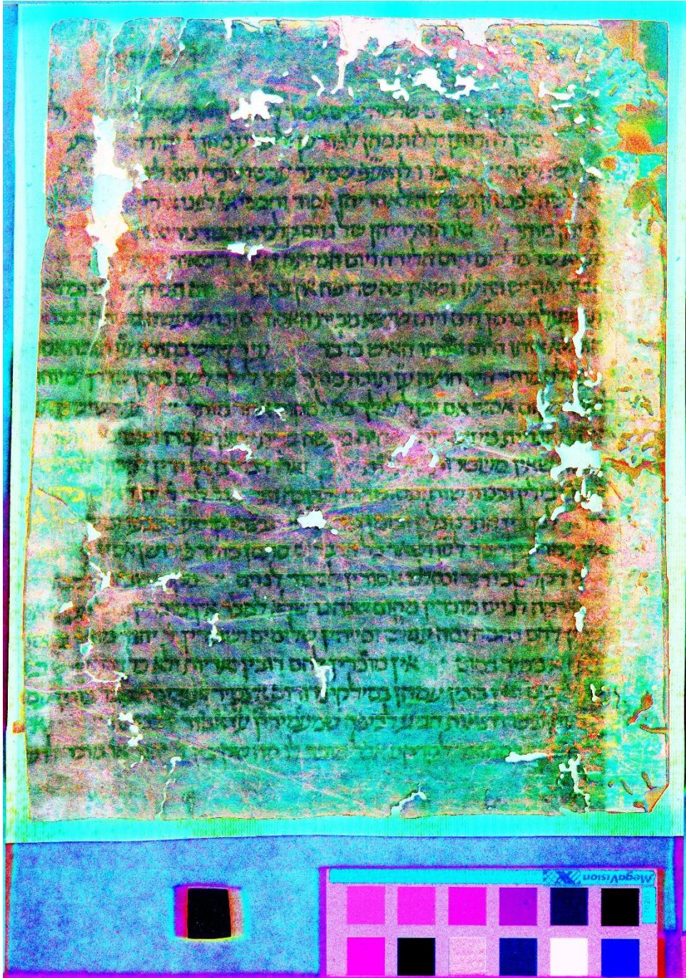
CUL MS Add.1207.2 m. Avodah Zarah 1:1-8 multi-spectral image